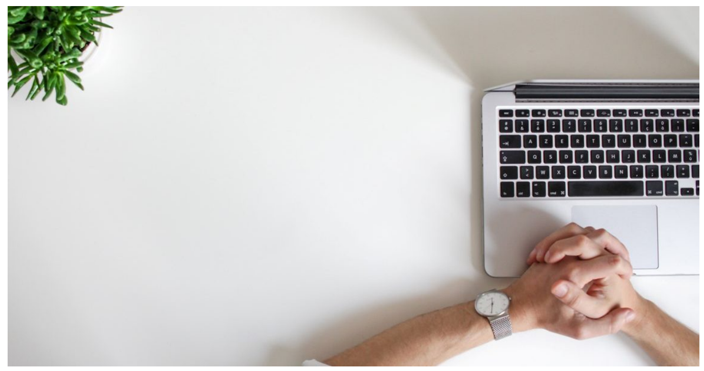
Audio Driver Windows 10 Realtek

While I'd been interested in Docker for a while, I hadn't had the time and energy to really dive into it.. Compare excel for mac Calculations and complicated functions can be completed at great speeds in Excel.. Some of the AbacusLaw features include: • legal calendaring • legal workflow processing • time tracking • billing • invoicing • payroll processing AbacusLaw's is unique because it is a customizable law firm accounting software. pdf to xlsx converter portable free download for android apk